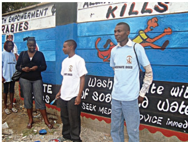
Community education, wall painting in Kenya.