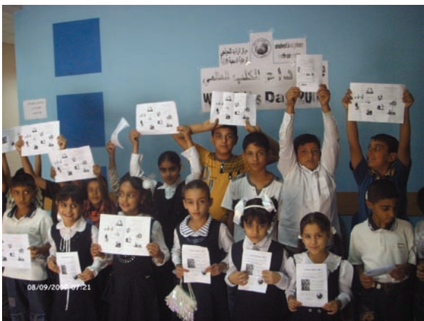
Educating school children in Iraq.