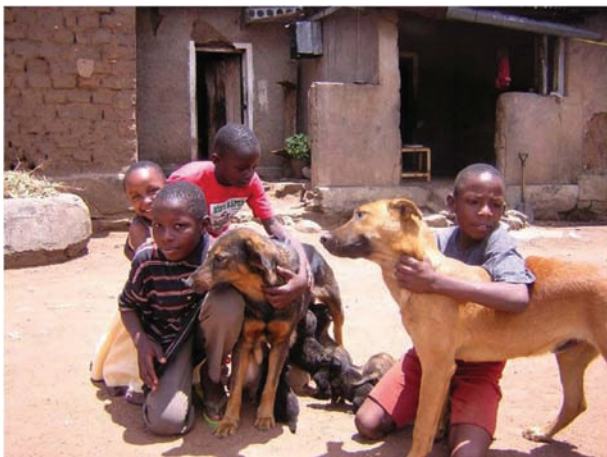
Children and dogs during vaccination campaign, Tanzania.

Thanks to the ongoing support of our partners and volunteers, WRD continues to flourish; facilitating educational awareness and reigniting country-level rabies programs throughout the world! To continue providing outreach to those most at risk, we need your support. Please visit our web site to make a donation to the 2010 WRD Campaign. We need YOUR help to ensure that millions of human and animal lives continue to be saved each year.