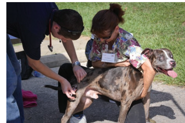
Rabies Vaccination Clinic, United States.

Thanks to our partners, WRD outreach packages were mailed to 10,000 veterinary clinics and Colleges of Veterinary Medicine across the globe continue to embrace and energize WRD. This year the European Commission kicked-off their annual Veterinary Week on World Rabies Day, highlighting its importance as the embodiment of One Health and encouraging the collaborative participation of veterinary and medical organizations throughout Europe.