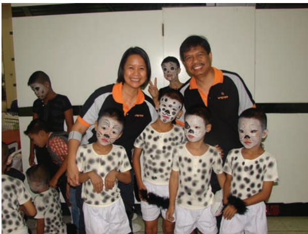
WRD Celebration in Bangkok, Thailand.

The Association of Southeast Asian Nations (ASEAN) resolved to observe WRD annually and, in Thailand, events were held in all 76 provinces. Additionally, for the first time, WRD events took place in Iraq, Afghanistan and Palestine. Among notable in-kind support this year was a donation of over $250,000USD of life-saving rabies biologics from an anonymous donor to Pakistan.