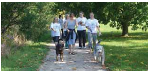
Walk for Rabies at the University of Guelph - Ontario, Canada

Rabies is a terrible, yet preventable disease. Approximately half of all human rabies deaths occur in children under the age of 15. Unfortunately, rabies continues to cause considerable suffering for people and animals and can also have a devastating impact on livestock and wildlife populations. If you would like to support the World Rabies Day initiative, please visit our website WorldRabiesDay.Org to find out how to make a tax deductible donation.