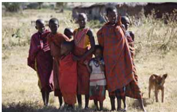
Mass rabies vaccination program - Serengeti, Tanzania, Africa

World Rabies Day (WRD) is the only worldwide event focused specifically on preventing human and animal rabies. The first World Rabies Day was widely promoted by organizers and participants in over 74 countries, and as a result, over 54 million people across the world received educational messages in their own languages about how to prevent rabies. The second World Rabies Day on September 28, 2008 has proven to be another success! Thanks to the tireless efforts of our partners and local event coordinators around the world, hundreds of events, largely comprised of rabies awareness and education venues, were held in at least 85 countries with participation by various agencies such as local/state/national governments, private industry and non-governmental and community based organizations.