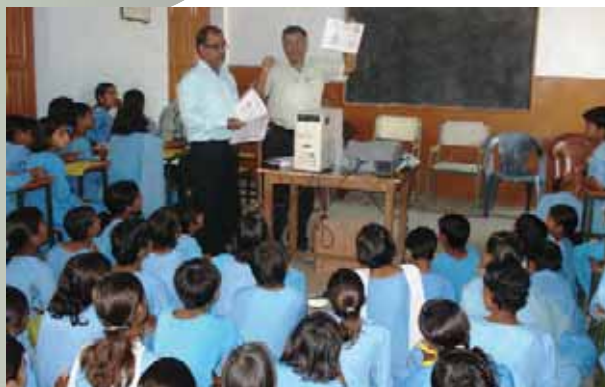
Interaction on rabies with school children - India

In addition to countless educational conferences and seminars, there were numerous vaccination clinics, commemorations, parades, runs and walks. Just some of the many novel events being reported this year include a dog fashion show in Zamboanga, Philippines, a weekly radio show in Nigeria which allowed people to call in and ask questions about rabies, and an on-stage discussion about rabies prevention with movie stars, held in Thailand. Major announcements and accomplishments, such as the signing of the North American Rabies Management Plan between the U.S., Canada and Mexico took center stage at the 19th International Conference on Rabies in the Americas (RITA) at the U.S. Centers for Disease Control and Prevention in Atlanta, Georgia.