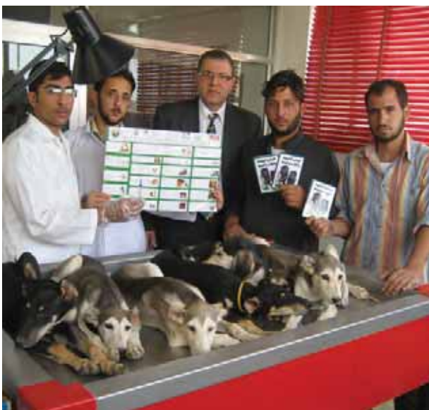
Materials distributed to all schools by Ministry of Education - Syria